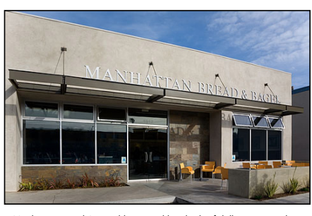
Manhattan Bread & Bagel has saved hundreds of dollars per month in energy costs by making simple changes

Partnering for Waste Reduction and Conservation Efforts